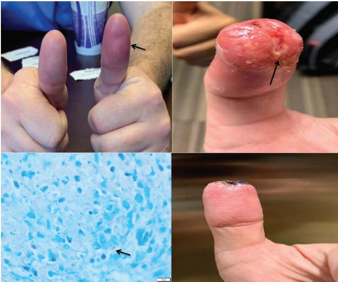
Figure 1. Top left: Redness and edema of the left distal thumb (arrow) at 10 days after needlestick injury. Top right: Suppurative and chancre-like lesion on the distal thumb (arrow) at 21 days after needlestick injury. Bottom left: Histologic section of skin biopsy demonstrating acid-fast bacilli on Kinyoun staining (arrow). Bottom right: Improvement of the skin lesion 1 week after antituberculosis therapy.

but further testing showed a positive T-spot. Magnetic resonance imaging of the left hand (conducted 22 days after the needlestick) was consistent with osteomyelitis of the distal phalanx of the thumb. Since there was worsening of the lesion, the patient underwent an excisional debridement with a bone biopsy that revealed a necrotizing granulomatous inflammation and acid-fast bacilli on histopathological examination (Figure 1). The tissue culture yielded Mtb . Of interest, the putative source (patient zero) had a polymerase chain reaction (PCR)-positive result for Mtb in the LN biopsy. Our patient had negative induced sputum cultures for Mtb and a 4-drug regimen was started (daily isoniazid 300 mg, rifampin 600 mg, ethambutol 800 mg, and pyrazinamide 1500 mg). The isolate was found to be susceptible to rifampin, ethambutol, and isoniazid using the automated MGIT system (Becton Dickinson). The skin lesions improved within 1 week of anti-TB therapy (Figure 1). The patient returned to work afterward and gained normal thumb functions, except for mild numbness at the tip. However, 4 weeks after starting the anti-TB medications (7 weeks after inoculation), he noted left axillary swelling and severe pain, with