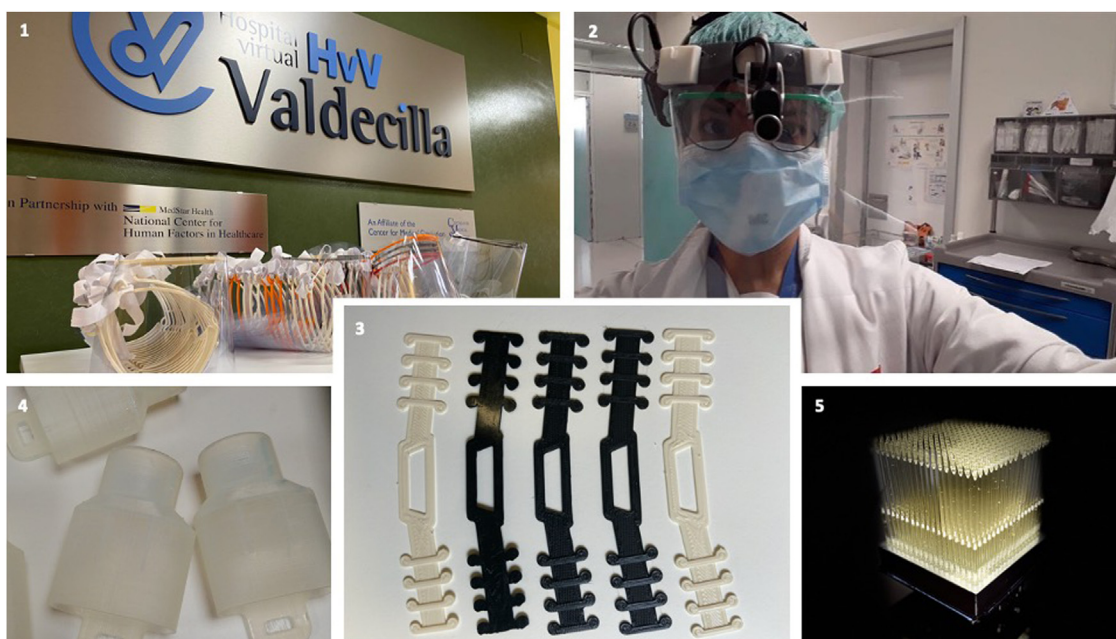
Figure 1 Face shields (1), surgical headlight accessories (2), ear clips for masks (3), connectors for non-invasive ventilation (4) and nasopharyngeal and oropharyngeal swabs (5) manufactured by 3D printing at the Hospital Marqués de Valdecilla.

* Preventive Medicine and Patient Safety Service. Hospital Marqués de Valdecilla (drafted 17/03/2020).