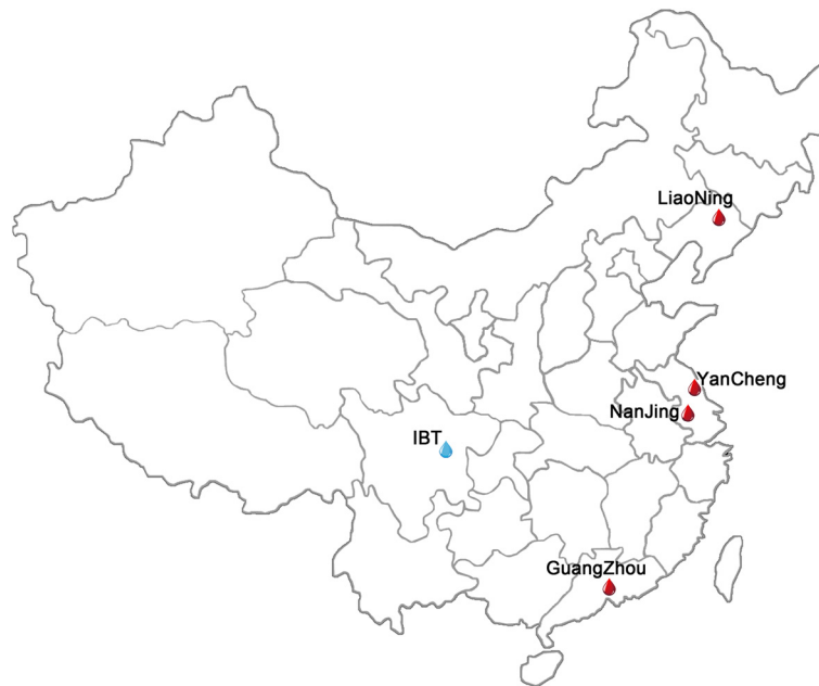
Figure 1 Locations of study sites in China. IBT = Institute of Blood Transfusion.

participating blood centers, but all versions contained the required screening fields mandated by the Chinese Ministry of Health. Pre-donation rapid testing procedures vary across blood centers, but all tested for hepatitis B virus surface antigen (HBsAg), ABO blood type, and hemoglobin. Alanine aminotransferase (ALT) screening was also being performed at selected centers. Liaoning blood center began HBsAg predonation rapid testing in May 2001; all the other blood centers began this test before 2000. Risk behavior detected in the health history questionnaire, an abnormal result in pre-donation rapid testing or failure to pass the physical examination (e.g., body weight lower than 45 kg) resulted in the donor's deferral. Donors who meet the donor eligibility requirements proceeded to donate blood.