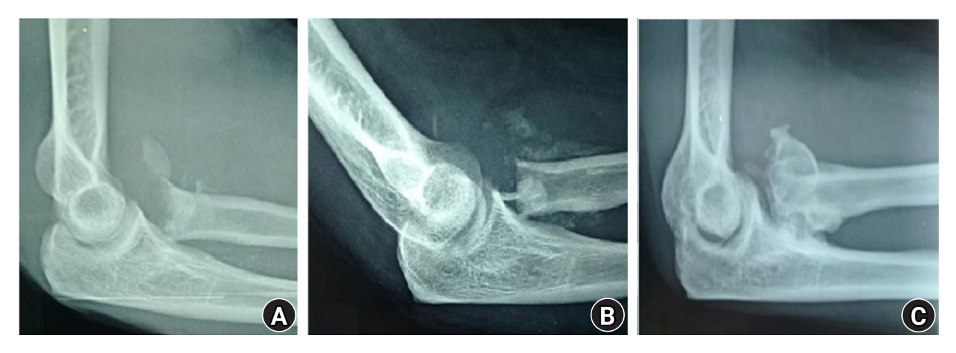
Fig. 5. The profile X-ray of case 2. (A) Posttraumatic. (B) Postoperative. (C) Heretopic ossifications at 19 months limiting flexion.