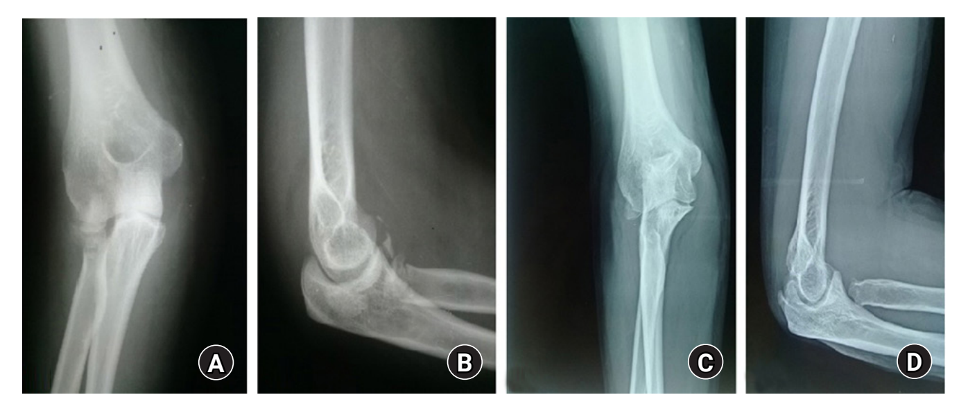
Fig. 3. The elbow radiography of case 1. (A, B) Face and post traumatic profile. (C, D) Face and profile at 61 months; no ossifications.