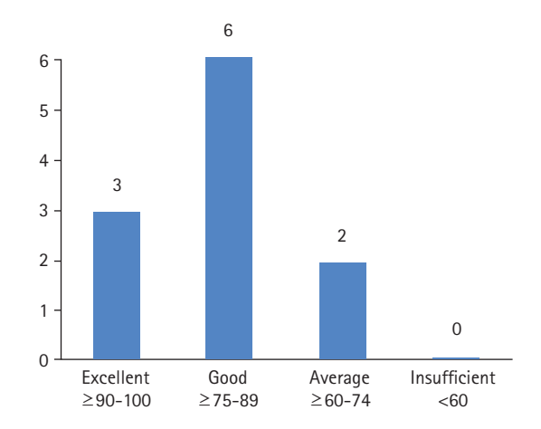
Fig. 6. Elbow function according to the Mayo Elbow Perfomance Index.

mon [9,10]. The time from initial injury to operation varied from 8 days on average in the study by Eren et al. [11] to 29 days in the report from Obert et al. [10]. Our average follow-up of 4 years was still quite short compared to other studies. The longest follow-up period observed was 19 years in the Karlsson et al. [9] study and 30 years in the Janssen and Vegter [12] study. Radial head resection surgery has associated complications that can interfere with elbow function. Ascension of the head and instability in the valgus are complications specific to this indication and are frequently accompanied by valgization of the elbow [12-14]. Other complications common to any joint surgery such as joint limitations and heterotopic ossifications are quite common [15]. These specific and non-specific complications are often responsible for stiffness that further affects the function of the elbow [16]. In this study, valgization of the elbow was found in 63.6% of the cases compared to 20% in the Karlsson et al. [9] study. However,