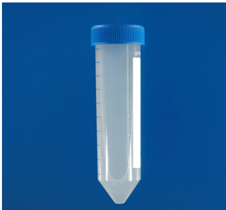
Figure 2. Image showing the “milky” appearance of the bronchoalveolar lavage fluid performed for the left B4 bronchus.

The patient provided his written informed consent for the publication of these findings.