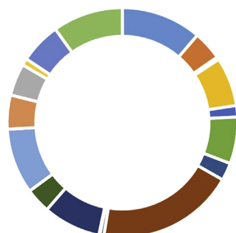
Distribution by country