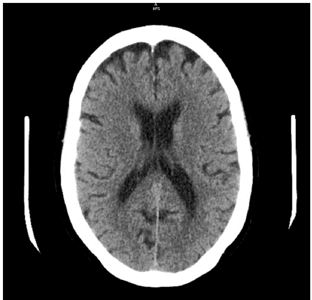
FIGURE 1: Computed tomography Scan of Head with out contrast showed no acute abnormalities.

On presentation, her physical exam consisted of a blood pressure of 173/78 mmHg but otherwise normal vital signs, normal neurologic examination, and tenderness to palpation in the left lower quadrant. Initial laboratory workup revealed an elevated white blood cell count of 12,300/ul of blood with 51% lymphocytes on differential, low sodium at 127 milliequivalents per liter, potassium at 3.5 milliequivalents per liter, chloride at 95 milliequivalents per liter, creatinine at 0.42 milligram/deciliter, AST at 88 U/L, ALT 99 U/L, alkaline phosphatase at 119 U/L, total bilirubin at 0.8 mg/dL, calcium at 7.8 mg/dL, and albumin at 3.2 g/dL. Lipase was normal at 60 U/L, serum osmolality was 250 milliosmoles/kilogram of water, urine osmolality was 280 milliosmoles/kilogram of water, thyroid stimulating hormone and serum cortisol at 5 AM was normal at 2.0 milliunits/liter and 16 ug/dL respectively. Computed tomography (CT) of the head revealed no acute abnormalities (Figure 1)