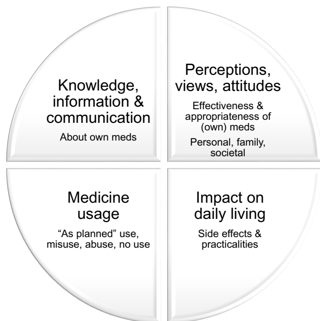
Figure 2 Thematic core categories of most meaningful/important PROs for assessment during polypharmacy medicines reviews.

Knowledge about one's own medicines, understanding the intended benefit of medicines, obtaining information and communicating about own medicines were considered the most important and meaningful PROs to be assessed during medicines reviews. Participants justified their views by raising points around the need to: Help people understand what medicines they take, what they are for, what they do, what the intended benefit is, and how to self-manage; Understand the need for more information and people's appetite for more information, while assessing any residual uncertainty; Have access trustworthy information about medicines; Ensure that the patient understands and is happy to follow the treatment plan; and Promote effective communication between patients/carers and healthcare professionals, and among providers and services.