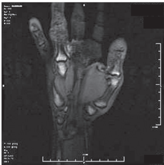
Figure 3. Abnormal T2-weighted signals on magnetic resonance imaging. The joint space remained. A giant cell tumor of the bone was diagnosed.

tissue, and opening of the joint capsule, it was found that the tumor had infiltrated into the joint and destroyed the bone. Part of the tumor reached the joint, causing severe local damage of the bone. No indication of a simple tumor resection was found. Subsequently, an osteotomy was performed in the segment 0.5 cm from the proximal and distal regions of the joint to completely remove the tumor tissue. No significant tumor infiltration was found in the palmar tendon or soft tissue. A drill was used to expand the space to encompass nearly the entire bone marrow cavity of the intermediate phalanx, and a Swanson #2 artificial silicone joint (Wright Medical Technology, Inc., Memphis, TN, USA) was placed inside the joint space. The residual dorsal capsule and ligaments on either side were sutured to strengthen and protect the joint. The wound was repeatedly washed. The local soft tissue and skin were sutured and wrapped with aseptic dressing. The treated finger