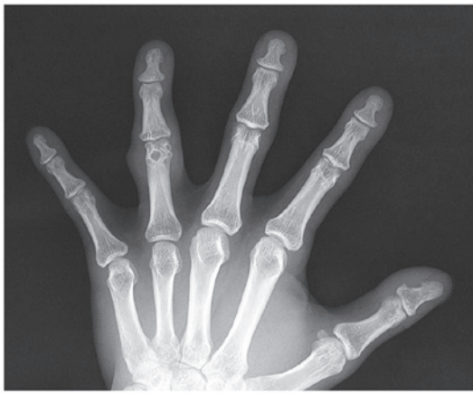
Figure 1. An X-ray of the right hand showing distal bone destruction of the proximal phalanx of the ring finger and swelling of the soft tissue.