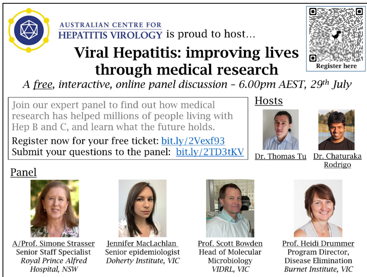
Figure 1. Poster designed by ACHV to advertise the discussion panel event.