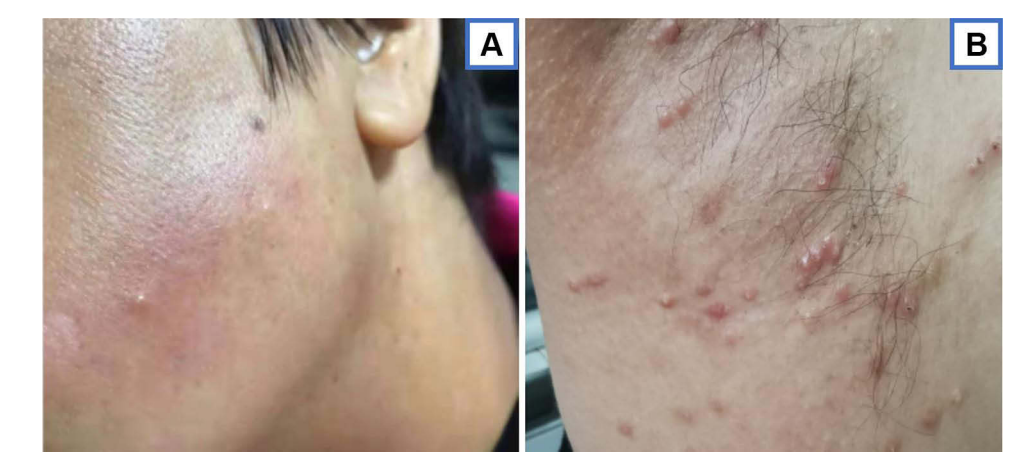
Figure I Painful erythematous papules studded with white blisters on the patient's left face (A) and right axillary skin (B).

effusion showed that her total cell count, percent of segmented cells, percent of lymphocytes, adenosine deaminase, and protein concentration were 140 \times 10^6 /L, 70%, 30%, 3.8 U/L, and 37 g/L, respectively. Her Rivalta test was positive, and the effusion was proven to be exudative. Histopathology of the rashes and the lymph node biopsy specimen obtained from the patient confirmed SS (Figure 2). Candida was repeatedly isolated from the sputum, while microbial cultures of the blood and alveolar lavage fluid were negative. In addition, there were no abnormal findings on bronchoscopy. Following treatment with vancomycin, moxifloxacin, cefoperazone, fluconazole and dexamethasone during hospitalization, the patient's symptoms improved, and the rash subsided. Repeated routine blood tests showed a WBC count of 12.4 \times 10^9 /L, a neutrophil count of 7.92 \times 10^9 /L and a hemoglobin concentration of 108 g/L. Chest CT showed absorption of the pulmonary lesions and pleural effusion. The patient was discharged from the hospital on October 20, 2010. She was continuously treated with oral prednisone and thalidomide outside the hospital, and her condition was stable However, the patient was admitted to the People's Hospital of Guangxi Zhuang Autonomous Region due to a pulmonary fungal infection and SS and was hospitalized from March 2011 to May 2011. Her specific process of diagnosis and treatment was unknown, and she was discharged after her condition improved.