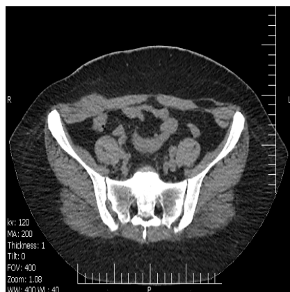
Fig.1: Computed tomogram of the abdomen and pelvis.