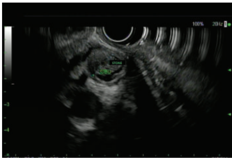
FIGURE 2: Upper endoscopic ultrasound.

as there was progressive improvement in alleviating her stone burden.