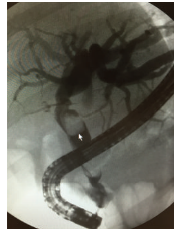
FIGURE 3: Endoscopic retrograde cholangiopancreatography.

A few weeks later, a laparoscopic surgery was converted to an open surgery, and the patient was found to have congenital absence of the gallbladder. Intraoperative cholangiogram showed no remaining large stones in the common bile duct. A liver biopsy was taken and revealed mild nonspecific hepatitis and stage 3 bridging fibrosis without cirrhotic nodularity. No stainable iron, copper, or A1AT globules were visualized.