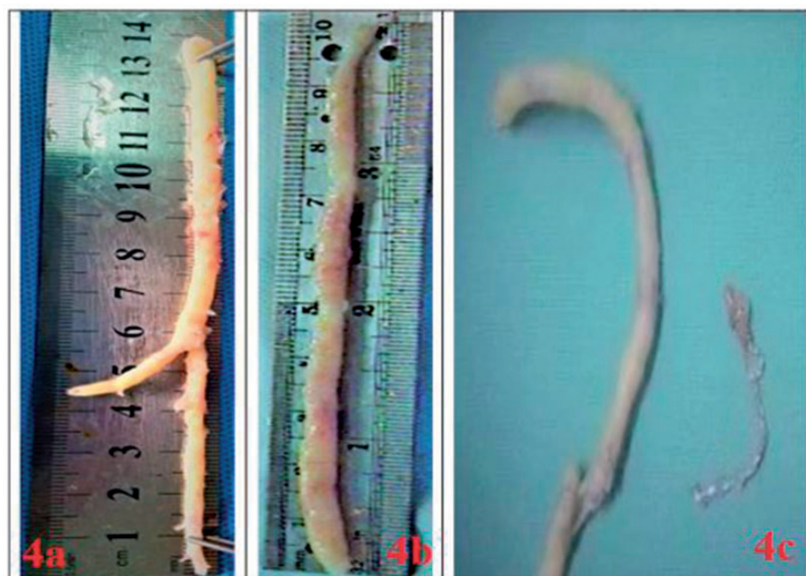
Figure 4. Long segment atheroma removed by Professor Asit Baran Adhikary (a and b) and atheromatous plaque with stent in situ (c): 14 cm longest atheromatous plaque extracted from RCA (a); 10-cm long segment atheroma from LAD (b). RCA: right coronary artery; LAD: left anterior descending.

(IABP) was very minimum in our study (only 0.8%). The mean follow-up period was 10.5 \pm 2.5 months. In our review, 92.7% patients were in regular follow-up, and significantly 91.8% of our patients were angina free at median follow-up of 2.5 years. However, 88.7% of study population were free from angina at long-term follow-up over a period of 5 years. Amid this follow-up period, 85.8% of the Endarterectomy of Coronary Artery (ECA) patients were in Canadian Class I and 14.2% in Canadian Class II. The rest of the post-operative characteristics including mortality and morbidity are listed in Table 3.