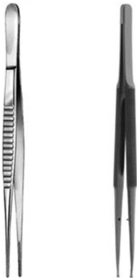
Figure 3. Instruments used for the removal of the atheromatous plaque during off pump coronary artery bypass grafting (OPCABG).

the conduits was extended to coordinate the arteriotomy, with the exception of few situations where venous patch was utilized. In this study, complete proximal endarterectomy was avoided due to the possibility of competitive flow loss between the graft and native artery. To ensure complete expulsion, the atheromatous plaque was carefully inspected for a smooth distal taper end. In addition, back flow of blood from the distal vessel following extraction of the atheroma is a consoling indication of adequate removal of atheromatous plaque and that is a special feature in OPCABG endarterectomy. In our study, longest atheroma (14 cm) was removed from right coronary artery (RCA) and also another 10-cm atheromatous plaque extracted from left anterior descending (LAD) coronary artery during OPCABG (Figure 4).