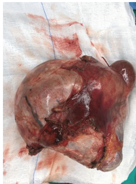
FIGURE 2: Ovarian teratoma of the left ovary.