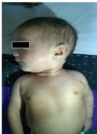
FIGURE 2: Showing maculopapular rash over baby's face and trunk.

and unavailability of other specific JMML diagnostic workup such as spontaneous colony assay, GM-CSF hypersensitivity and diagnostic dilemma persisted. Meanwhile, patients had received a repeat course of IVIG and platelets transfusion, and platelet count increased to 150 \times 10^9/L on day 3 of IVIG.