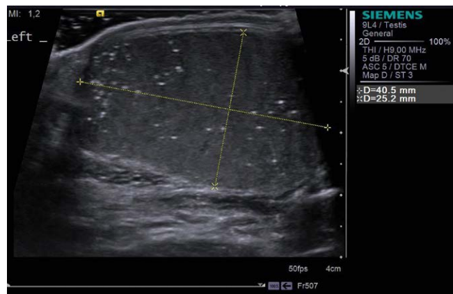
► Fig. 4 Ultrasound image of a testis with TML including volume measurements.

well with ultrasound measurements, even if ultrasound may slightly overestimate testicular volume [5, 20]. Another limitation is that comparison of testicular volume occurred between symptomatic patients and not between asymptomatic men from the general population. The proportion of patients with TML was high in the study population, but if the study population was e. g. twice as large, it may have been possible to show a significant difference between patients with and without TML, and not just a trend.