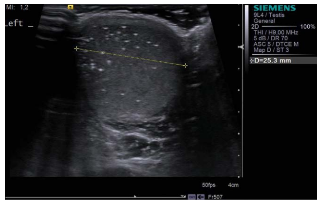
► Fig. 3 Ultrasound image of a testis with TML including volume measurements.

One of the strengths in this study is that scrotal ultrasound is easily performed and not a very time-consuming tool. Four investigators obtained testicular volume measurements, which limits the interobserver variation. This is confirmed in a study that showed good correlation between three investigators when measuring testicular volume [12], and ultrasound has been recognized as a reliable method. We did not use an orchidometer to measure testicular volume. On the other hand an orchidometer seems to correlate