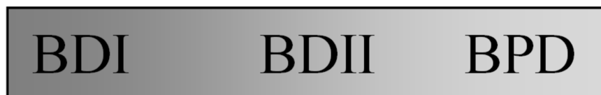
FIGURE 2: Possibility of BD and BPD being on a spectrum of one disorder

BD: bipolar disorder, BPD: borderline personality disorder