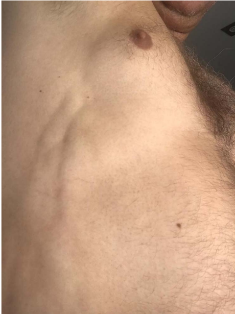
Figure 1: Right-sided painful cord-like palpable induration.

clinic. Treatment was continued with an intermediate dose of the LMWH enoxaparin (60 mg) and a nonsteroidal anti-inflammatory drug. Laboratory tests confirmed the diagnosis of chikungunya (IgM: positive; IgG titer > 1/160).