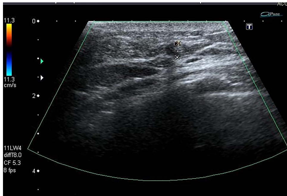
Figure 2: Duplex ultrasound: thrombosed right-sided superficial thoracic vein (transverse view).

The most important step after the diagnosis of MD is distinguishing between primary MD (which accounts for 45% of all MD cases) and secondary disease, in which a predisposing factor or underlying disease is present. Most secondary cases seem to be linked to trauma (22%) or are iatrogenic (20%). Association with breast cancer is less frequent (5%) [5], but MD can be the first manifestation of breast cancer, even in male patients [6,7].