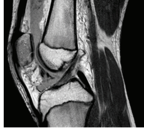
FIGURE 3: Sagittal T1 weighted magnetic resonance image taken one week after presentation.

At four weeks after injury, the patient was mobilising using his crutches. On examination, only a small residual effusion was noted and radiographs revealed though no further displacement, and the fracture line was still visible. He was able raise his leg straight but flexion was limited to 15 degrees. The patient was put in a knee brace at this visit, fixed to a range of 0–30 degrees with a plan to gradually increase