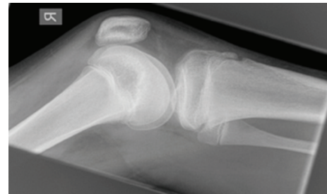
FIGURE 4: Lateral radiograph of the right knee taken seven weeks after injury.

the range of movement of the knee. He was also referred to physiotherapy.