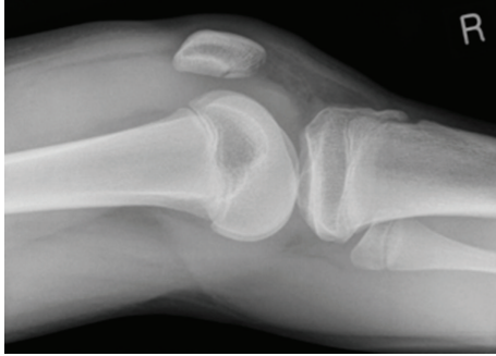
FIGURE 1: Lateral radiograph of the right knee taken on initial presentation.