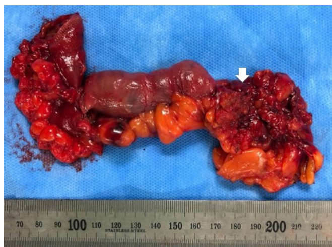
Fig. 4. A specimen from small bowel segmental resection with partial cystectomy: the arrow indicates the location of the enterovesical fistula between the Meckel diverticulum and the urinary bladder.

cation of Meckel diverticulum, accounting for 14%–53% of complicated cases, followed by diverticulitis, enterolith formation, and perforation [8, 10]. A neoplasm, such as a carcinoid, sarcoma, or adenocarcinoma, accounts for up to 3% of complicated cases [11].