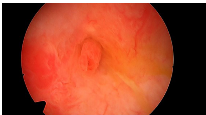
Fig. 2. A fistula opening at the dome of the bladder was detected with cystoscopy.

Meckel diverticulum was performed with partial cystectomy. Macroscopic findings also indicated that the tip of a Meckel diverticulum was connected to the urinary bladder (Fig. 4). The final histologic findings demonstrated a gastric-type Meckel diverticulum with a vesicointestinal fistula.