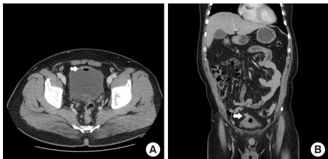
Fig. 1. (A) Mild, diffuse bladder wall thickening with intravesical air density (arrow) in the axial section; (B) adjacent small bowel (arrow) on the dome of the bladder on a coronal section.