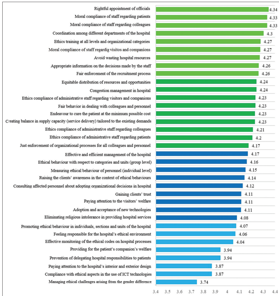
Figure 2: The importance of organizational ethics in Imam Khomeini Hospital Complex (IKHC)

supply capacity (service delivery) tailored to the existing demands; Effective and efficient management of the hospital; and Ethics training at all levels and organizational is used to test the average of a community to judge its functional status. What are the priorities for improving organizational ethics components in Imam Khomeini Hospital Complex? The vertical axis represents the ultimate weight (importance) of the organizational ethics model in the hospital [based on the results of Figures 2 and 3]. The cut point was also obtained from the mean of all the points in the performance dimension (value of 2.59) as well as the importance dimension (value of 4.15). Based on Figure 4, the organizational ethics model can be analyzed and organized as follows: The first quadrant is a critical area (priority and focus area, red points). The first priority pertains to the first quadrant, i.e., critical measures, which are of high importance and low performance and are presented in red. The following indicators were identified in the hospital: https://targoman.ir/d/fa/%D8%B9%D8%A7%D8%AF%D9%84%D8%A7%D9%86%D9%87/ "Rightful appointment of officials; Fair enforcement