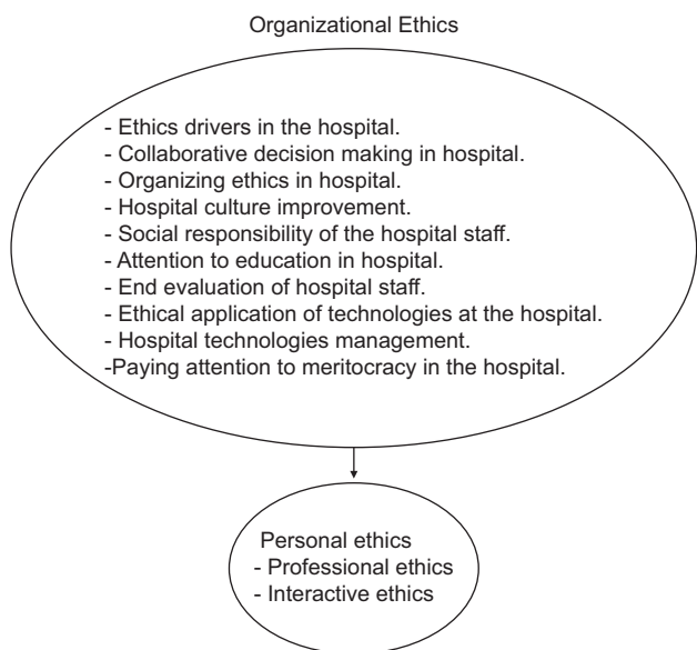
Figure 1: “Ethics drivers in the hospital” and “personal ethics”

organizational ethics components in Imam Khomeini Hospital Complex? The vertical axis represents the ultimate weight (importance) of the organizational ethics model in the hospital [based on the results of Figures 2 and 3]. The cut point was also obtained from the mean of all the points in the performance dimension (value of 2.59) as well as the importance dimension (value of 4.15). Based on Figure 4, the organizational ethics model can be analyzed and organized as follows: The first quadrant is a critical area (priority and focus area, red points). The first priority pertains to the first quadrant, i.e., critical measures, which are of high importance and low performance and are presented in red. The following indicators were identified in the hospital: Rightful appointment of officials; Fair enforcement of the recruitment process; Congestion management in hospital; Just enforcement of organizational processes for all colleagues and personnel; Equitable distribution of resources and opportunities; Fair behavior in dealing with colleagues and personnel; Creating balance in