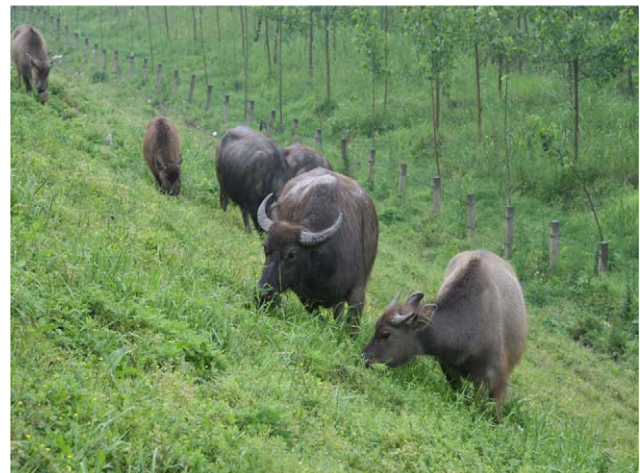
Figure 5. Simple fence to prevent water from buffaloes grazing on the vast marshlands ( Oncomelania snail host habitat) of the Dongting Lake region. doi:10.1371/journal.pntd.0001053.g005

Ultrasonography (US) is a safe, rapid, non-invasive, and relatively inexpensive technique for assessing schistosomiasis-related lesions in individual patients and in community surveys [44,45]. US has been used extensively for classifying morbidity/liver fibrosis in schistosomiasis patients from Dongting Lake and other endemic areas of the PRC using World Health Organization criteria [4,5,13,35,46,47]. These criteria were improved following hepatosplenic measurements among 550 Chinese individuals, aged 3–59 years, from Yueyang city, a non-endemic area for schistosomiasis around Dongting Lake [46]. A recent study of lake patients, involving a direct comparison of S. japonicum -induced fibrosis detected by US and liver biopsy pathology, indicated a moderate agreement between the two procedures, although US underestimated hidden fibrotic lesions in the liver [32].