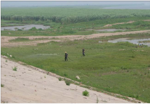
Figure 3. Snail control through mollusciciding (niclosamide, 50% wettable powder, 2 g/M 2 by spraying), performed annually March to May in the Dongting Lake area. doi:10.1371/journal.pntd.0001053.g003

endemic areas, where the procedure is more sensitive than stool examination. Nevertheless, faecal examination is recommended, if there is positive serology, to increase specificity and because antibodies persist after parasitological cure. A positive serological test may be an early indication of infection in patients where no eggs are present, such as those with acute schistosomiasis (Katayama syndrome). Serology may also be informative in monitoring and determining whether infection has re-emerged in a region after an apparently successful control program [41].