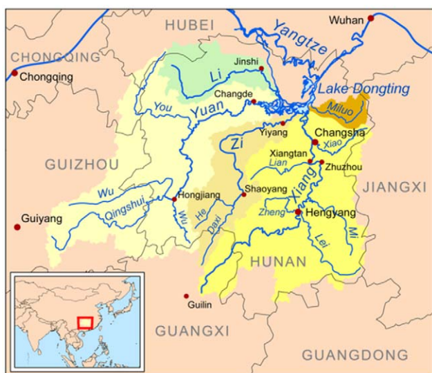
Figure 1. Map of Dongting Lake (a flood-basin of the Yangtze River), Hunan province, People's Republic of China, and its five feeder rivers.

The rich sediment of the marshland attracted farmers, and several embankments were built to keep out the Yangtze River and to gain more farmland. Unfortunately, silting of mud and sand in the lake, in addition to the anthropogenic environmental transformations in the lowland areas, reduced the lake area and its storage capacity and caused rapid deterioration of the lake's flood diversion and flood storage functions. This diminishing capacity increased the occurrence of disastrous flooding, mainly because of the rupture of embankments. After a serious and major flood in 1998, the State Council of the PRC formulated a policy, the Return Land to Lake Program, to prevent flooding. This program envisioned returning cultivated lands into lake areas with the result that over 1 million people and their domestic animals from schistosomiasis-endemic areas were resettled to newly established towns around Dongting Lake during the period 1999–2004 [12].