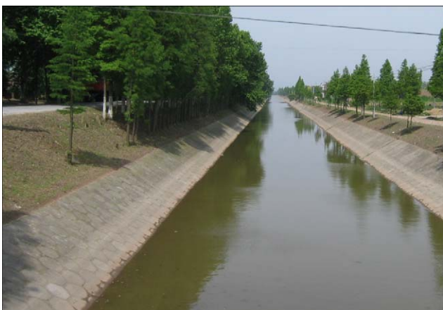
Figure 4. Concrete irrigation system for environmental modification prevents the establishment of Oncomelania snail habitats and subsequent schistosome transmission in the Dongting Lake area. doi:10.1371/journal.pntd.0001053.g004

The detection of non-invasive biochemical markers of hepatic fibrosis has been a focus of research on Dongting Lake patients with schistosomiasis. Serum levels of procollagen peptide (types III and IV), the P1 fragment of laminin, hyaluronic acid, fibrosin, TNF- \alpha -II and sICAM-1, tissue inhibitors of matrix metalloproteinases (TIMP)-1, and platelet-derived growth factors (PDFG)-BB may be elevated in patients with severe hepatic fibrosis [5,42]. Another Dongting Lake study determined the diagnostic value of non-invasive serum biomarkers of fibrosis using 84 advanced schistosomiasis japonica patients, recruited at different stages of disease progression, and nine controls, histologically assessed by