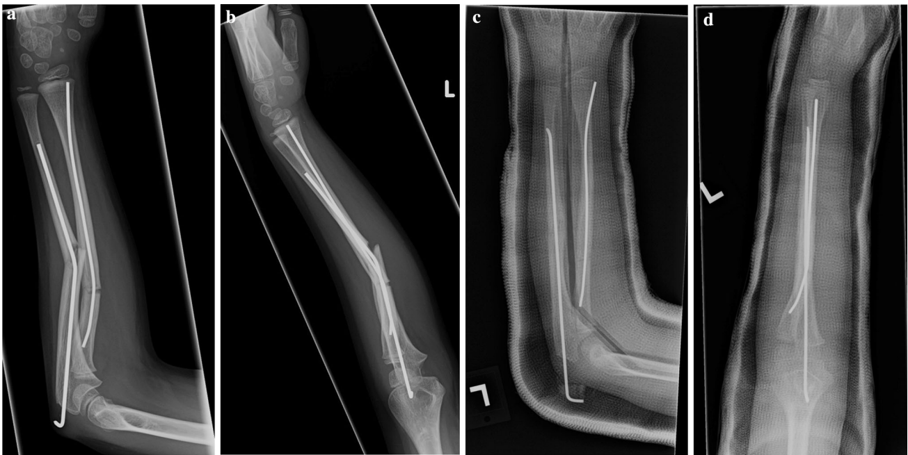
Fig. 1 Anteroposterior (a) and lateral (b) radiographs of a 6 year old girl (Patient 1) who sustained a refracture after a trip and fall. She was treated with rebending of the radial implant and removal and replacement of the ulnar implant (c, d)