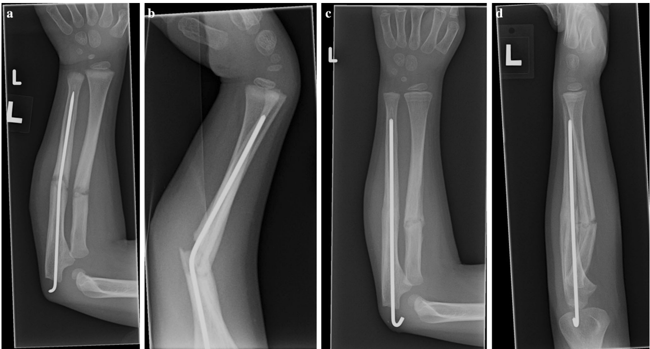
Fig. 2 Anteroposterior (a) and lateral (b) radiographs of a 4 year old boy (Patient 3) who sustained a refracture from a fall from bed. He was treated with removal of his ulnar implant and introduction of a new nail (c, d)