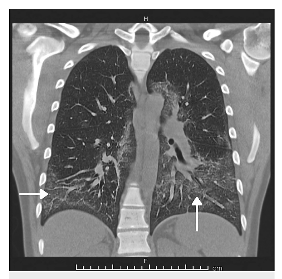
FIGURE 3: Computed tomography (CT) chest (coronal view) - Bilateral lung infiltrates due to EVALI

EVALI: E-cigarette or vaping product use-associated lung injury