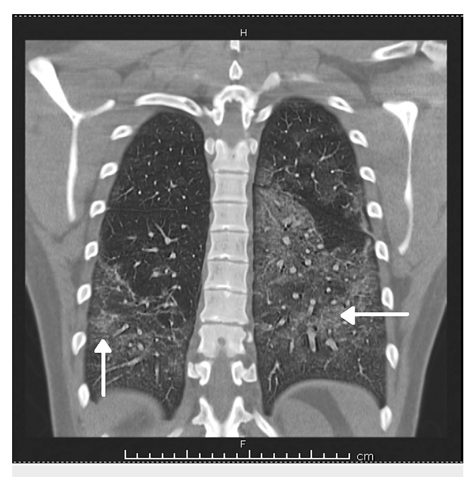
FIGURE 2: Computed tomography (CT) chest (coronal view) - Bilateral lung infiltrates due to EVALI

EVALI: E-cigarette or vaping product use-associated lung injury