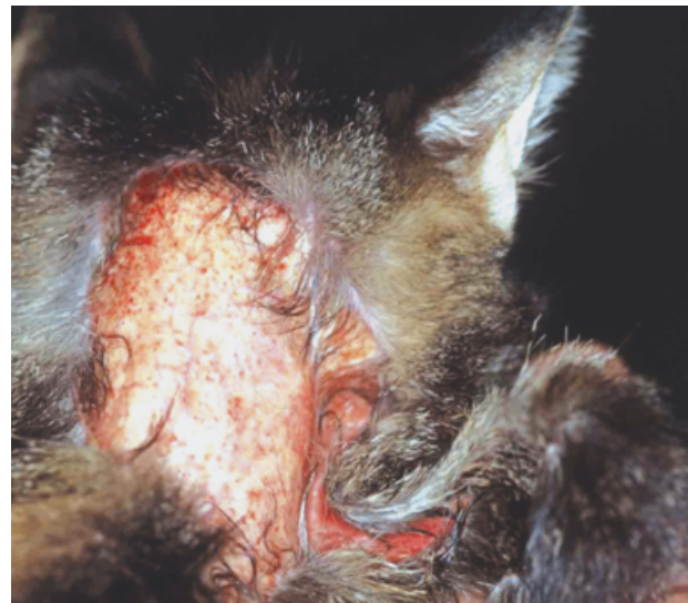
Figure 1. Feline acquired skin fragility. Dorsal neck just caudal to the ears. A flap of skin has torn and exposed underlying subcutis and muscle.

Analysis of the abdominal fluid revealed a pale yellow liquid with a specific gravity of 1.033, and a total protein content of 5.3 g \text{dL}^{-1} . The nucleated cell count was 316 cells \mu\text{L}^{-1} . Cytology of the abdominal fluid revealed 86% nondegenerate neutrophils, 13% macrophages, and 1% small lymphocytes. The fluid was characterized as a modified transudate with an acute inflammatory component.