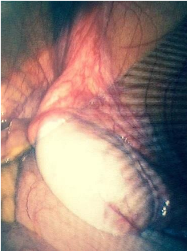
Figure 3: intra- abdominal testes: laparoscopic aspect