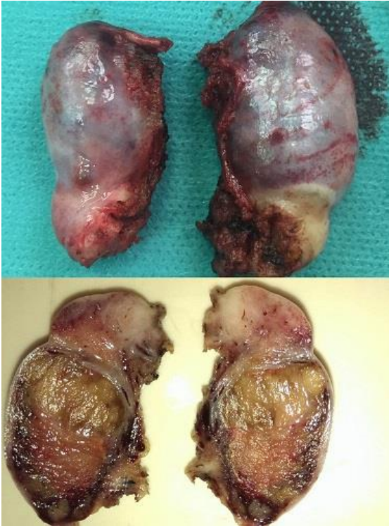
Figure 4: the excised testis: Macroscopic aspect