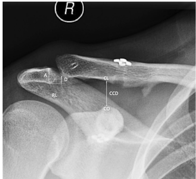
Fig. 1 Measurement protocol. “CO”, tip of the coracoid; “CL”, inferior cortex of the clavicle; distance “CCD”, coracoclavicular distance measured between CO and CL; distance “A”, acromial thickness measured as the distance between the superior and inferior margin of the acromion; line “RL”, reference line at the inferior acromial cortex placed perpendicularly to A; distance “D”, distance between RL and the lowest and most lateral point on the clavicle measured perpendicularly to RL

overcorrection at index surgery. Consecutively, the ratio between clavicular displacement in relation to the acromial thickness, the D/A ratio, was calculated [16]. Radiographic measurements were performed using a digital ruler (accuracy 0.1 mm) via a DICOM medical imaging viewer using the picture archiving and communication system (PACS). Loss of reduction after hardware removal was defined as an 10% increase in the CCD compared to preoperatively (prior to hardware removal), while loss of reduction was deemed substantial if the CCD increased 6 mm postoperatively compared to preoperatively, as previously proposed [8, 34, 39]. Horizontal instability was not assessed in this study, as stress radiographs in crossbody adduction views were not routinely performed immediately following surgery at the senior author’s institution.