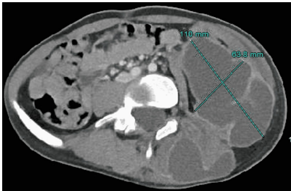
FIGURE 2: Collection centered within the left iliopsoas extending laterally into the abdominal oblique musculature and inferiorly into the inguinal region, measuring 110 mm × 63.8 mm.

The patient was then admitted to the hospital under isolation precautions. During a further interview, it was found that the patient's father had a history of TB when the patient was two years old; associated treatment indicated that it was not drug-resistant TB. The father was given rifampin 600 mg, isoniazid 900 mg, pyrazinamide 3,500 mg, and ethambutol 3,200 mg for 2.5 months, followed by maintenance with rifampin and isoniazid for four months. Supplementation with pyridoxine was given, and treatment compliance was noted to be excellent. The patient himself also received prophylactic therapy during that time.