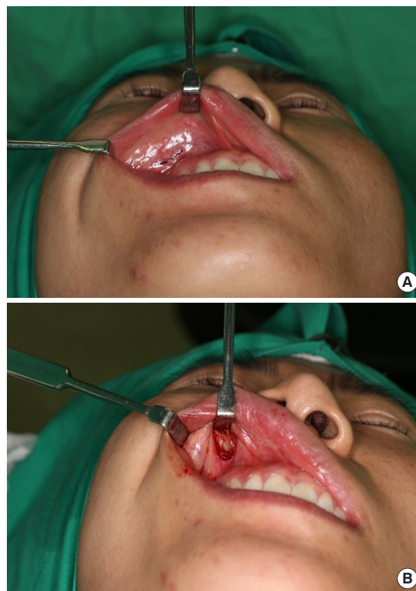
Fig. 2. Intraoperative photographs. (A) The masses were approached through an incision in the upper gingivobuccal sulcus. (B) Yellowish nodular masses were identified in the subcutaneous layer and complete excision was performed with primary closure.