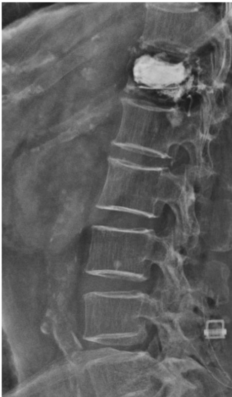
Figure 4. Case 2. One-year postoperative radiographs. No implant loosening or spinal structure fracture was noted in the images.

describes possible indications for nonfusion surgery with IntraSPINE ® implantation in patients with osteoporosis. More standardized reporting of clinical, radiographic, and biomechanical outcomes would be clinically beneficial.