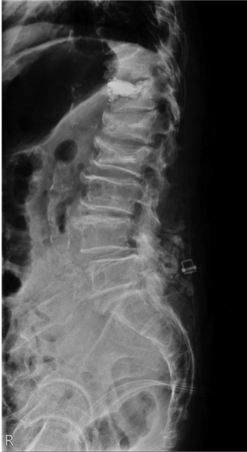
Figure 2. Case 1. One-year postoperative radiographs. No implant loosening or spinal structure fracture was noted in the images.

segments. 12 Thus, ASD can be avoided or delayed. These devices are divided into two categories: interlaminar devices and interspinous devices. However, osteoporosis is another important issue among the aging population.