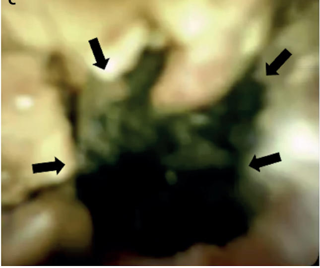
Figure 1. (A) Percutaneous transhepatic cholangiography showed three filling defect representing biliary stone in the right posterior intrahepatic bile duct (arrows) and a stricture at the confluence of the right posterior duct in the main right hepatic duct (arrowhead). (B) After percutaneous transhepatic cholangioscopic lithotripsy and cholangioplasty with cutting balloon remained a moderate stenosis at the confluence of the right posterior duct in the main right hepatic duct (arrow) without residual stones. (C) The endoscopic visualization of the biliary stone (arrows) in the right posterior hepatic duct during the percutaneous transhepatic cholangioscopy provided by the SpyGlass Direct Visualization System II (Boston Scientific Inc., Natick, Massachusetts, USA).

In the present case, the 8Fr biliary drain was left for three days, and at the beginning of the procedure the percutaneous tract was upsized to accommodate an 11Fr introducer, with 1mm dilatation of the tract diameter. As compared to larger cholangioscopes, SDVS II can reduce the traumatism required for fistula dilatation and the related complications, which are more frequent during this procedural phase (around 13% of the procedures) as compared to tract maturation or therapeutic percutaneous transhepatic cholangioscopy