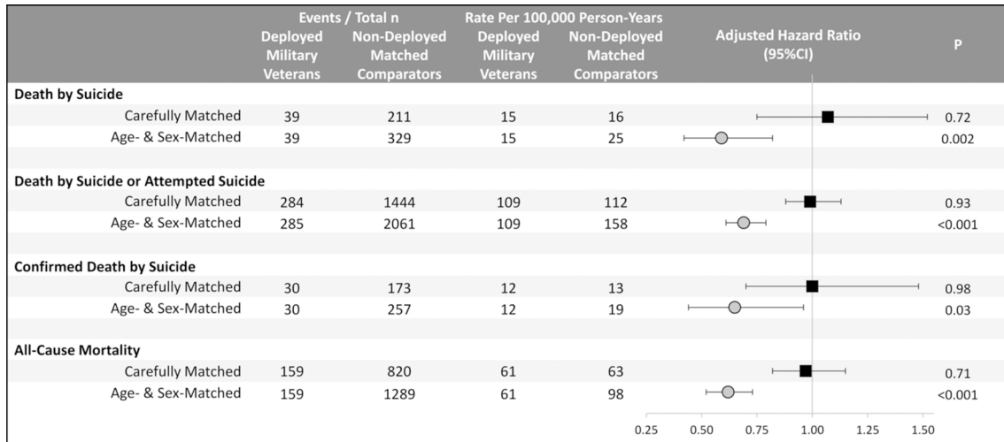
Figure 2 Death by suicide, attempted suicides and all-cause mortality among deployed military veterans versus carefully matched non-deployed comparators (n=21 627/n=1 07 284) and versus age- and sex-matched non-deployed comparators (n=21 628/n=108 140).

veterans in other countries, have been biased by failing to account for the greater cognitive, psychological and physical fitness of individuals selected for military deployment.