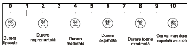
Fig. 2 The visual-analogue scale of pain

The patients have been repeatedly examined at 3, 6 and 12 months postoperatively, then only once a year. The dynamic of the painful syndrome was underlined by using the visual analogue scale of pain (Fig. 2). An independent examiner analyzed the final postoperative success at 1-3 years after the surgery, according to MacNab scale (Table 1) [18]. The functional disability was highlighted by the Oswestry Disability Index (ODI) scale ver. 2.1. (Table 2) [16,17].