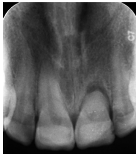
FIGURE 4 Immediate postoperative periapical radiograph for tooth #21

Endodontic treatment and bleaching were successfully used to manage a discolored maxillary central incisor due to internal resorption. 7 Internal and external tooth whitening using 16% Carbamide Peroxide were also successfully performed to manage a dark tooth with poor esthetic appearance