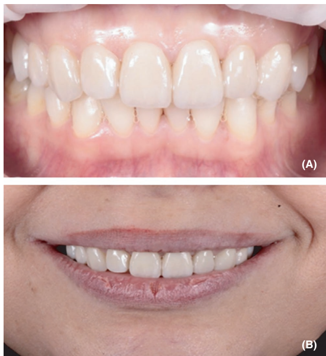
FIGURE 3 Postoperative clinical photographs. A, Retracted frontal view of the maxillary and mandibular teeth in the maximum intercuspation position. B, Frontal smile view

an excellent esthetic appearance and function. PLV is a valuable tool to achieve the desired results in salvaging and restoring the discolored teeth with minimally invasive treatment. A precise diagnosis and treatment plan makes it possible to obtain predictable, optimum, and satisfactory results and support in restoring the patients' confidence (Figures 3 and 4).