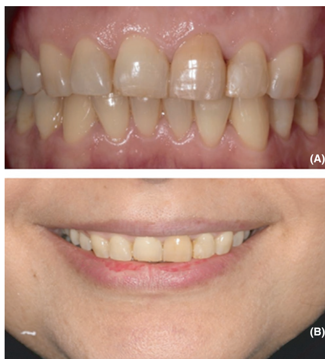
FIGURE 1 Preoperative clinical photographs. A, Retracted frontal view of the maxillary and mandibular teeth in the maximum intercuspation position. B, Frontal smile view

The result shows that discolored teeth in response to dental trauma can be successfully managed with PLV's and provide