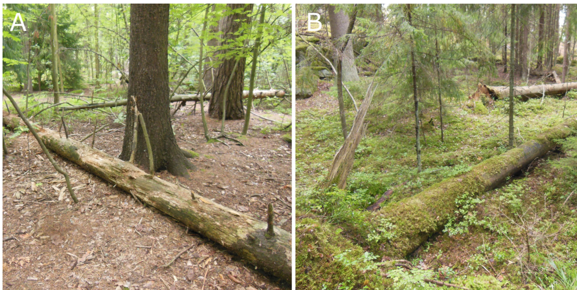
Fig. 1. Heavily worn (A) and mostly intact (B) decaying Norway spruce ( Picea abies ) trunks in mesic heath forests in Helsinki, Finland. The forest stand in panel A is situated in a remnant forest area within the urban matrix (approximately 4000 residents km -2 ). Intensive trampling has eroded the surface layer of the decaying tree trunk and eliminated most of the vegetation on the forest floor. The forest stand in panel B is situated in a recreational forest area at the urban fringe (<200 residents km -2 ). Forest vegetation at this site is mostly intact and epiphytic vegetation has developed on the surface of the decaying tree trunk. Both trunks were included in the present study.

Non-metric multidimensional scaling (NMDS) of the WIF community data ( n = 90 ; stress = 0.186) showed that