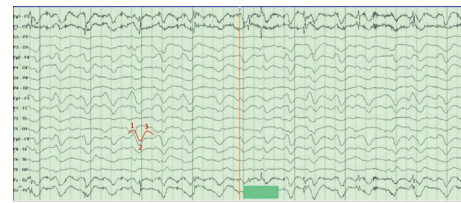
FIGURE 2: Continuous electroencephalography (CEEG). CEEG shows generalized slowing with triphasic waves. The three phases of the wave that give the classic triphasic morphology are highlighted. Intracranial pressure at the time of this CEEG was 6 mmHg.

A 51-year-old female with a history of hypertension and atrial fibrillation taking warfarin presented to the emergency department after sustaining a ground level fall. Her Glasgow coma scale (GCS) score was 7 (E: 2/V: 1/M: 4). She was intubated for airway protection. Her neurological exam was significant for withdrawal from painful stimulus, bilaterally reactive pupils, brisk deep tendon reflexes (DTR), and bilateral upgoing toes. Computed tomography (CT) head showed a right temporal contusion with surrounding vasogenic edema and a small right frontal subdural hemorrhage (Figure 1). Computed tomography angiography (CTA) was negative for any vascular abnormality. Her international normalized ratio (INR) was 1.8. The coagulopathy was rapidly reversed with 4-factor prothrombin complex concentrate (25 U/kg). She was admitted to the neurosciences intensive care unit. An external ventricular device was placed with opening ICP of 14 mmHg. Overnight, the ICP increased to 25 mmHg and remained between 18 and 22 mmHg for the next 24 to 48 hours. She was treated with osmotherapy (i.e., mannitol and hypertonic saline) and propofol sedation for elevated intracranial pressure (ICP). Her CEEG showed moderate diffuse background slowing and excessive beta and spindle activity likely from sedation. Her elevated ICP responded to cerebrospinal fluid (CSF) drainage, osmolar