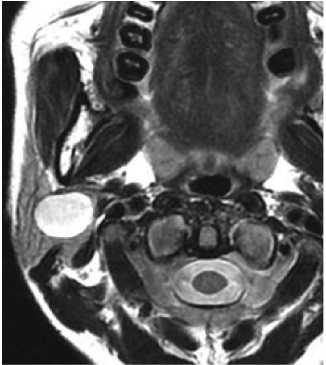
FIGURE 1: Axial T2-weighted image showing a heterogeneous, hyper-intense, cystic lesion in the right parotid.

A 34-year-old woman noticed a swelling in her right mastoid process approximately seven years before her first medical consultation regarding the condition. The lesion gradually enlarged and a facial spasm appeared on the right side of her face. She visited a city hospital and was diagnosed with a facial schwannoma via a brain and neck magnetic resonance imaging (MRI) scan (Figure 1).