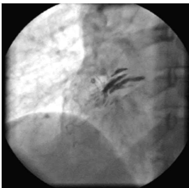
Figure 2. Dye Stasis in the Ascending Aorta Wall Suggestive of Dissection of Aorta

totally asymptomatic without any chest pain and with stable hemodynamic. Thus, she was admitted to the coronary artery unit (CCU) for more observations and evaluations. Two days after catheterization, CT angiography of the aorta was carried out revealing very small localized dissection of the aorta. The patient was totally asymptomatic with hemodynamic stability in the course of admission. Serial electrocardiograms and transthoracic echocardiographies also indicated no new changes since early echocardiography examination. Finally, the patient was discharged at the fifth day of admission. She also had no new complaints and was unremarkable in physical examinations during the follow-up visits.