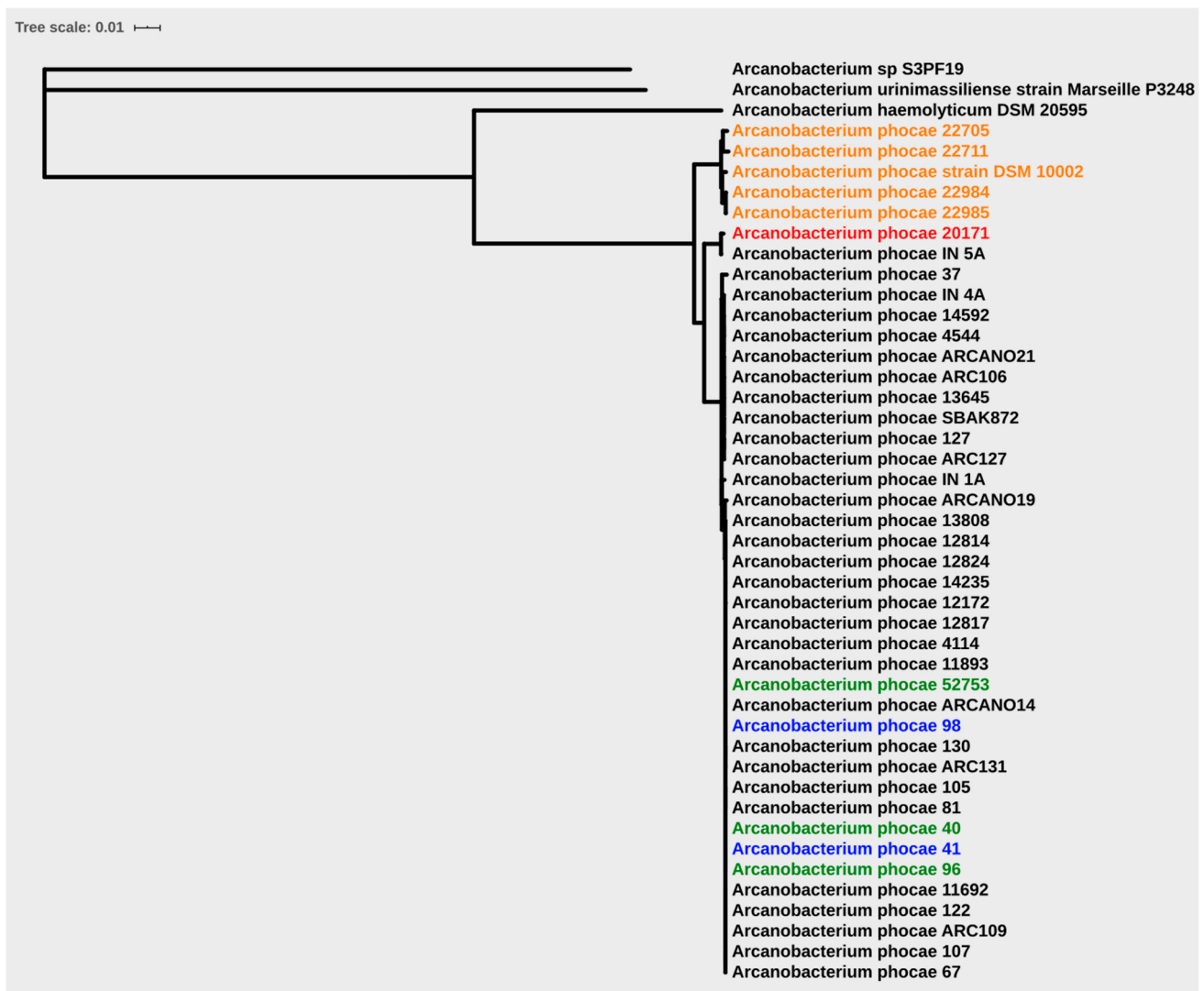
Figure 1. Phylogenetic tree based on core genome (Mink in black color, Finn-raccoon in green, Bluefox in blue, seal in orange and otter in red) (1296 genes).

through hunting for food. The same strain being found in a farmed mink in Spain is less easily explained and requires further study.