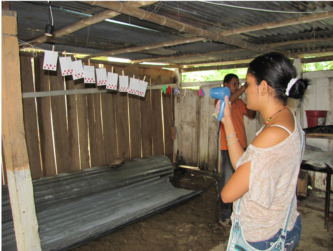
FIGURE 1 | Study settings. Dried blood spots drying on filter papers.

to proceed to the next steps. Hence, a biologist (FF) performed an electrophoresis on a polyacrilamide gel 4–18% on the eluted DBS samples of four individuals with stool microscopy positive for S. stercoralis (Supplementary Data Sheet 1). The elution was conducted overnight at room temperature in a buffer containing PBS, 0.05% tween 20 and protease inhibitor. The electrophoresis run for 3.5 h at 89 V. The bands corresponding to the IgG heavy (76 KDa) and light (26 KDa) chains were evaluated to confirm the good preservation of the samples.