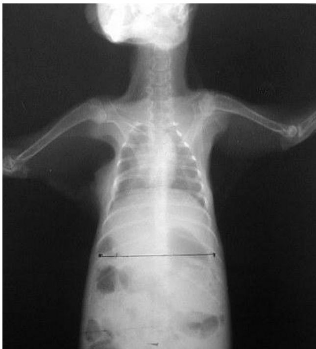
Figure 2 Postoperative 7 th day chest radiograph of a rabbit of control group.

groups received single dose prophylactic antibiotic, and received diclofenac sodium for postoperative analgesia for 3 days.