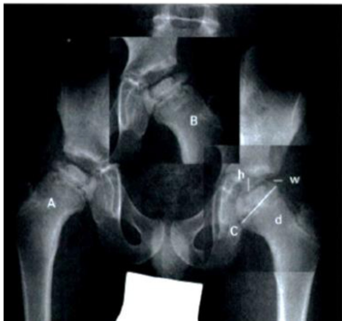
Figure 2 Deformity index (DI) (reproduced with permission. Nelson D, Zenios M, Ward K, et al. The deformity index as a predictor of final radiological outcome in Perthes' disease. Journal of Bone & Joint Surgery 2007;89:1369-74). The abnormal hip radiograph (A) is flipped horizontally (B) and overlaid on the normal hip image. DI is calculated using the maximum difference in epiphysial height (h) and width (w). The normal hip's physical diameter (d) is also calculated. 8

obtained, detailed assessment of inclusion and exclusion criteria is undertaken (box 1).