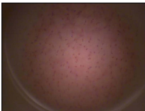
Fig. 2. Representative image of perfused capillaries of the skin of the finger, from a healthy control subject, obtained with high-resolution intra-vital color video microscopy and shown at a final magnification of 200 \times . For each patient, the mean capillary density was calculated as the arithmetic mean of the number of spontaneously perfused capillaries in three contiguous microscopic fields of 1 mm 2 each.