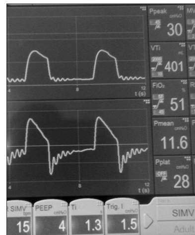
Figure 2: Oscillatory waves on expiratory phase of pressure and flow-time wave at PEEP 4