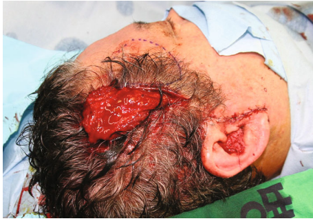
FIGURE 3: End-to-end microanastomosis was performed to the superficial temporal vessels through preauricular incision. The flap was inserted into the prepared subcutaneous pocket.