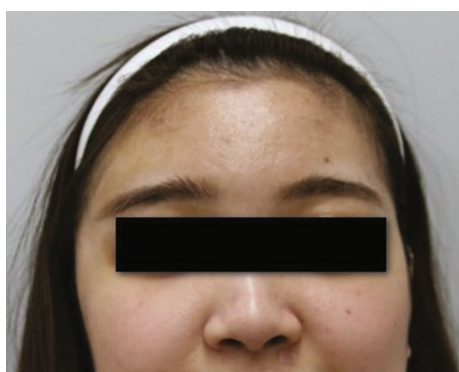
FIGURE 8: At the 48-month follow-up, the patient was satisfied with the temporal contours.

improvement, the use of the SA muscle and fascia flap can be a good option.