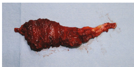
FIGURE 2: A 10 × 8 cm SA flap was harvested in accordance with the size of the deformity.

the patient was satisfied with the temporal contour (Figure 8).