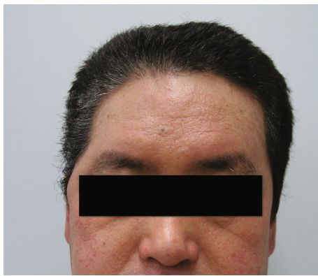
FIGURE 4: At the 24 month follow-up, the facial contours of the temporal area were maintained.