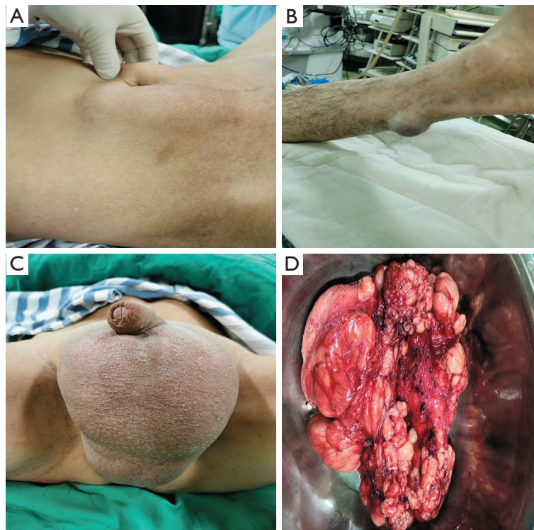
Figure 1 Scrotal lipoma with part of lipomas in multiple sites of the body and surgical specimen. (A) Lipoma in peripheral umbilicus. (B) Lipoma in left Achilles tendon. (C) Giant bilateral scrotal lipoma. (D) Surgical specimen after surgical excision.