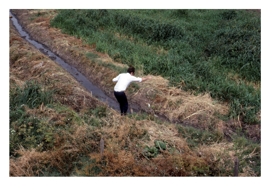
FIG 3 Placement of Moore swabs in the irrigation canals outside Santiago, Chile, in January of 1983.

Evidence incriminating the role of environmental contamination being responsible for maintaining the high incidence of typhoid in Santiago required active investigation. Careful inspection of the manner in which raw sewage was handled in Santiago and a series of painstaking environmental bacteriology studies utilizing Moore swabs incriminated the use of untreated sewage in the dry summer months to irrigate extensive fields of vegetable crops that were eaten uncooked as the practice that was responsible for maintaining amplified long-cycle transmission. This could not have been achieved without Moore swabs.