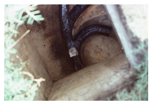
FIG 4 Sewer swab placed in the small diameter sewer draining three households in Santiago, Chile, in January 1983.

intermittent or if the carrier did not use the connected toilet during the sampling period. In cases of institutional sewage surveillance (e.g., hospitals and prisons), disinfectants may diminish sensitivity of the culture-based bacteriology (93).