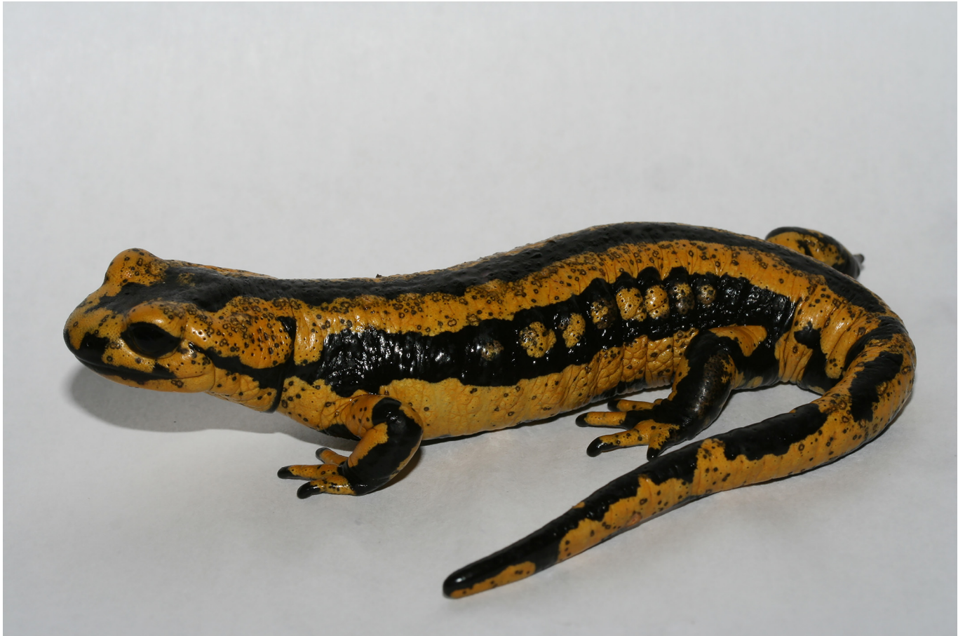
Fig 1. Fire salamander ( Salamandra salamandra ) covered with Bsal ulcerations, which are visible as black spots.