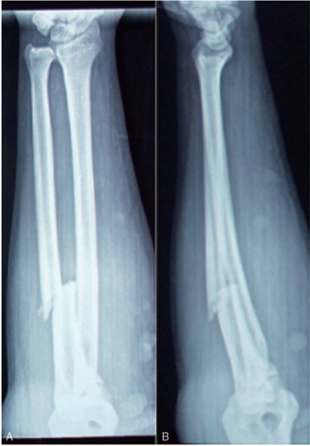
Figure 1. AP (A) and lateral (B) radiographs of the left forearm reveal dislocation of radial head with a concomitant fracture of the third proximal ulna. There is no concomitant dislocation of DRUJ in the initial presentation.

accident that occurred 5 months previously. Tracing back to the patient's initial record at the local hospital, the patient underwent fasciotomy and decompression of the forearm on the same day of the accident due to osteofascial compartment syndrome. Two months after the accident, he was misdiagnosed with a simple ulnar fracture and another operation called ulnar ORIF was performed without treatment of the dislocation of the radial head. Radiography demonstrated dislocation of the radial head with a concomitant fracture of the third proximal ulna upon initial presentation at the local hospital (Fig. 1A and B). In view of the extreme dissatisfaction with the recovery effect, the patient came to our hospital for further treatment. Upon examination, the patient was right-hand dominant with pain and deformity of the left elbow and the ulnar side of the wrist. Two old scars were visible on the left forearm, but no distal neurovascular deficits were noted. However, the piano-key test and the table-top test were positive according to the physical examination. Moreover, he was nearly disabled, with an extremely limited range of motion (ROM) of the left elbow and wrist compared with the contralateral extremity. According to the reexamination of wrist radiography, the secondary dorsal dislocation of the DRUJ was obvious both clinically and radiographically (Fig. 2A and B). Advanced computed tomography (CT) also confirmed the same diagnosis (Fig. 2E).